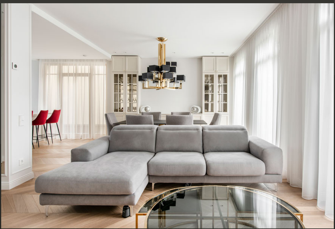
Swinging Ballet H12 | Private Residence, Lithuania