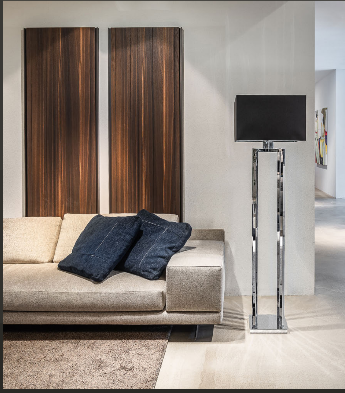
Swinging Ballet F1 | Project by Toss Design, The Netherlands