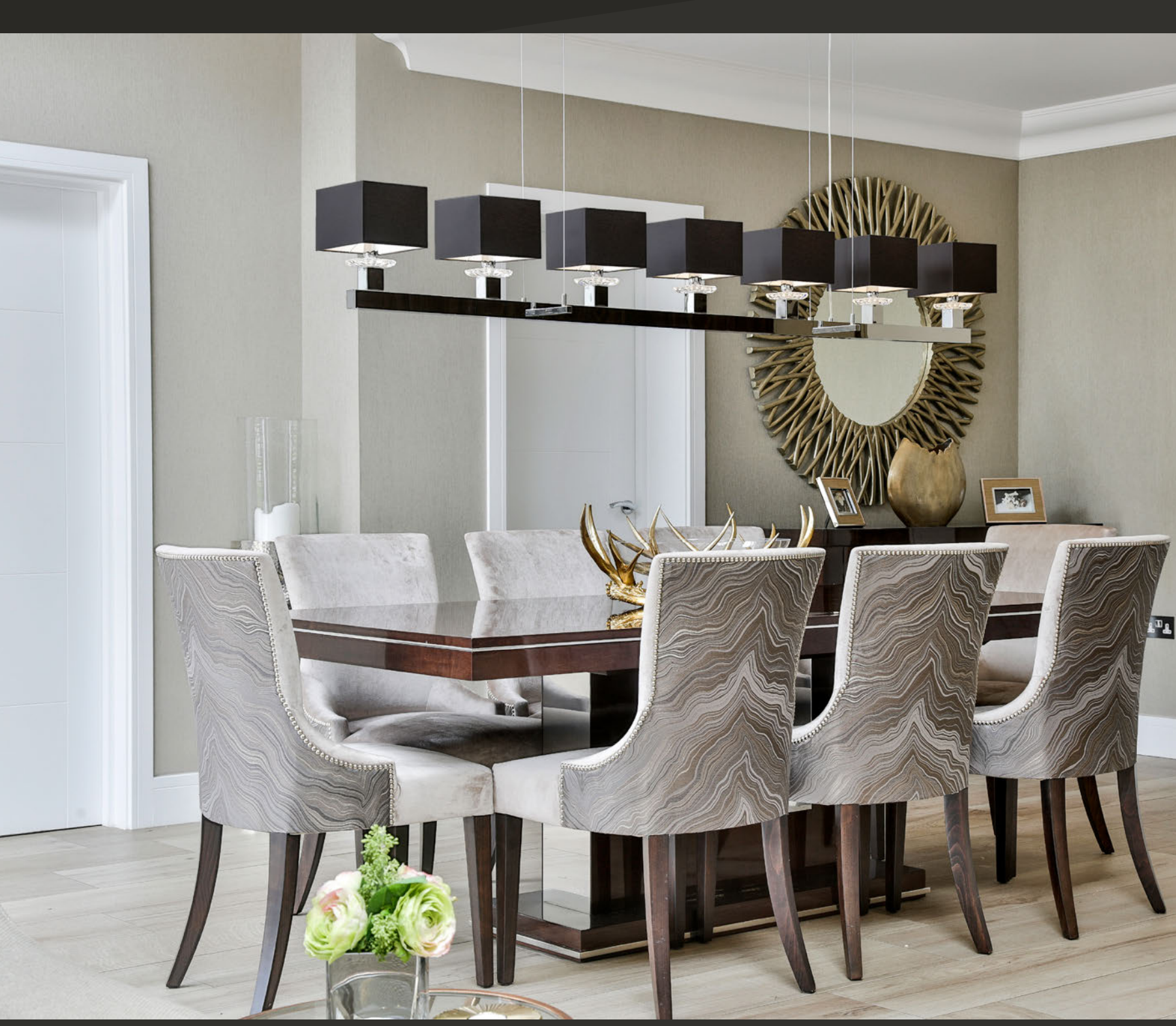
Swinging Ballet H7 | Project by Designer Touches, United Kingdom