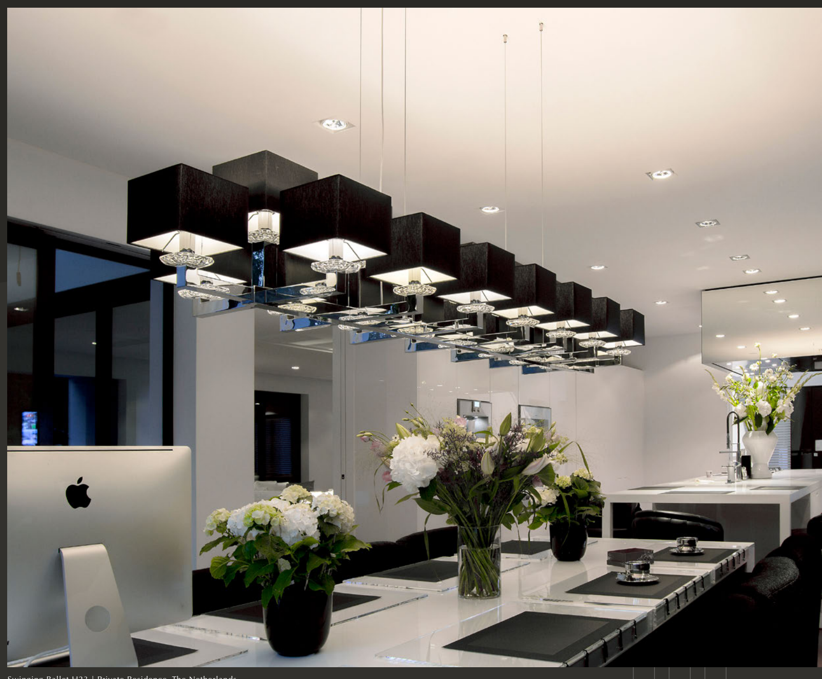
Swinging Ballet H23 | Private Residence, The Netherland