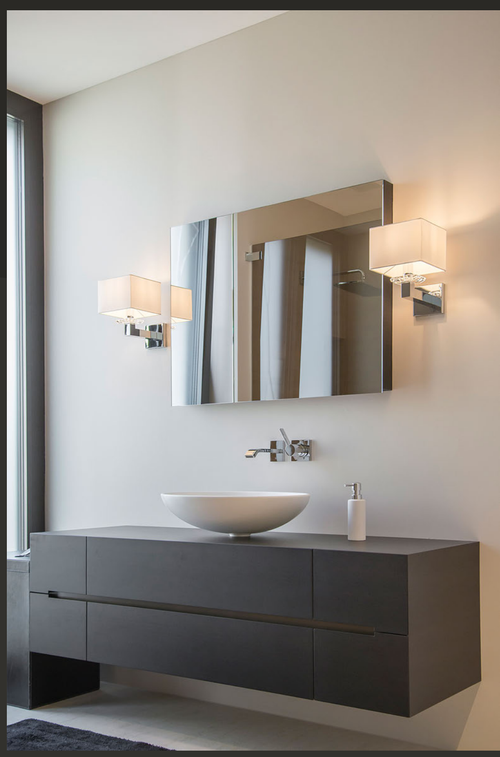
Swinging Ballet W1 | Private Residence, Switzerland